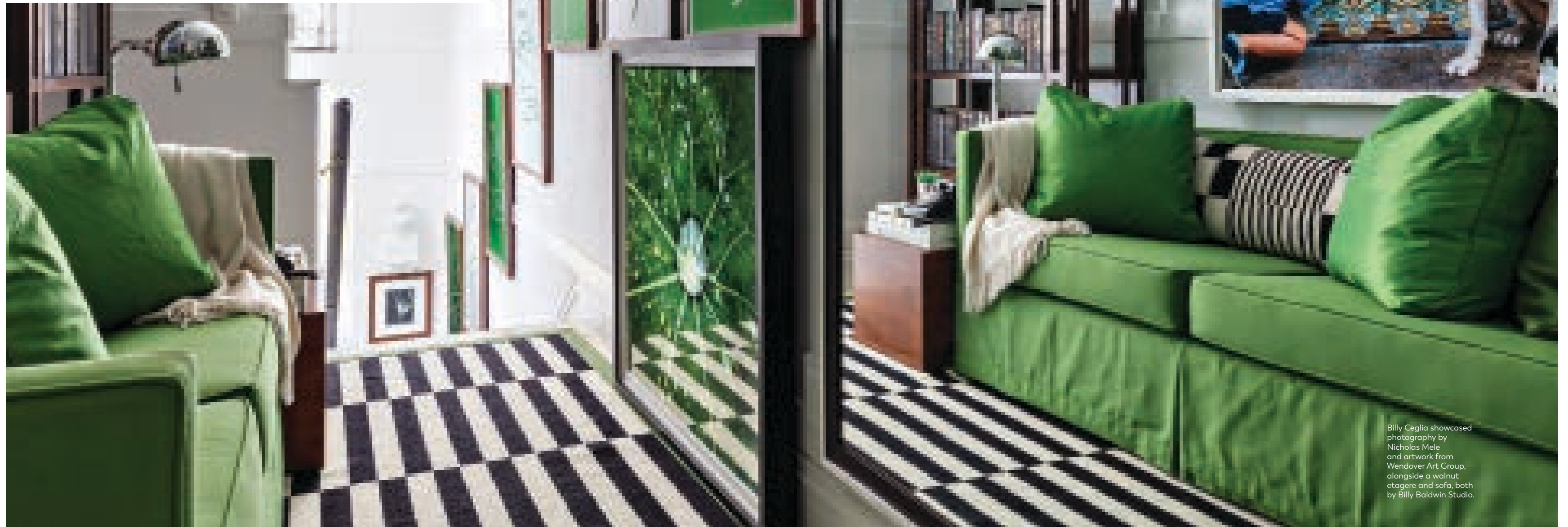
Billy Ceglia showcased photography by Nicholas Mele and artwork from Wendover Art Group, alongside a walnut etagere and sofa, both by Billy Baldwin Studio.

In just under four months, the group of talented designers from all over the country completely transformed each room of the 10,000-square-foot Fountain House. Prime examples of the bright ideas on show appeared in the grand double-height living room just beyond the entrance, which Greenwich- and Palm Beach-based designer Cindy Rinfret transformed into an Anatolian-tinged comfort zone wrapped in classic shades of blue and white and enriched with exotic antiques, such as a set of carved wooden arches, a pair of carved palm tree chairs and hanging linen